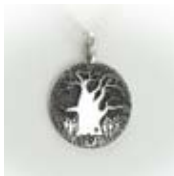
Sterling Silver Baobab Tree Small Pendant $285