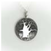
Sterling Silver Baobab Tree Mini Pendant $265