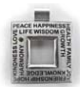
Inspiration Pendant $460 w chain $395 w cord

Made from 100% certifiable recycled sterling silver and also available in 18kt gold, and featuring an imperial chrome diopside gemstone the Inspiration Pendant is designed to encourage positive thinking and keep the focus on the important things in life like family, friendship, love and happiness.