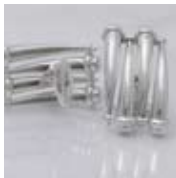
Sterling Silver Tusk Cuff Links $375

The Silver Elephant Tusk Collection is designed to raise awareness for the plight of the African Elephant. Once numbering in the millions, the African elephant population has dwindled to between 470,000 and 690,000 according to a March 2007 WWF estimate. The population is suffering due to the illegal ivory trade and loss of natural habitat. The Tusk collection features 100% certifiable recycled sterling silver and an imperial chrome diopside gemstone.