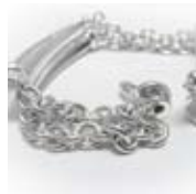
Sterling Silver Tusk Bracelet $595