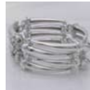
Sterling Silver Tusk Bracelet $1095