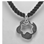
Small Leopard Spot $295