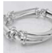
Sterling Silver Tusk Bracelet $695