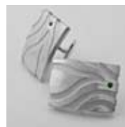
Sterling Silver Zebra Cuff Links $495