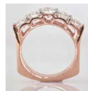
Ultima Band 18k Pink Gold 1.50 cttw