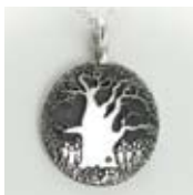
Sterling Silver Baobab Tree Large Pendant $460