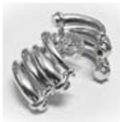
Sterling Silver Tusk Earrings $325