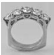
Ultima Band 18k White Gold 1.50 cttw