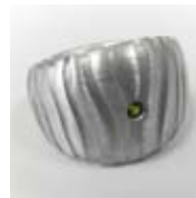
Sterling Silver Zebra Ring $330