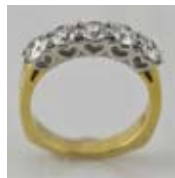
Amore Band 18k Yellow Gold 1.25 cttw