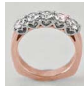
Amore Band 18k Pink Gold 1.25 cttw