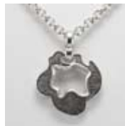
Large Leopard Spot $395

Made from 100% certifiable recycled sterling silver, the Leopard Collection is designed to raise awareness for the critically endangered Amur Leopard that roams the forests in eastern Russia. The Amur Leopard is one of the rarest 'big cats' in the world. There are fewer than 40 Amur Leopards that remain in the wild. The drastic decline in the Amur Leopard population is due to loss of habitat and poaching.