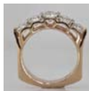
Ultima Band 18k Yellow Gold 1.50 cttw