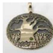
18k Gold Baobab Tree Pendant $6200