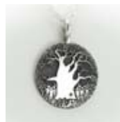
Sterling Silver Baobab Tree Medium Pendant $330