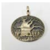
18k Gold Baobab Tree Pendant $3400