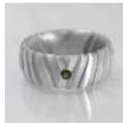
Sterling Silver Zebra Ring $330

The Zebra Collection is designed to raise awareness for the endangered Grevy's Zebra. Grevy's Zebra lives primarily in Ethiopia, Somalia, and Kenya. The species is under increasing pressure as they are being crowded out of their grazing habitat by livestock and other farming activities. The Zebra collection features a Zebra stripe pattern and is made with 100% certifiable recycled sterling silver and an imperial chrome diopside gemstone.