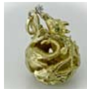
World of Africa Pendant with diamond accent $13000