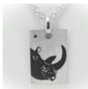
Rhino Dogtag $395

Made from 100% certifiable recycled sterling silver and featuring an imperial chrome diopside gemstone, the Black Rhino Dog Tag was created to raise awareness for the critically endangered Black Rhinoceros. According to latest WWF estimate there are only approximately 3,725 individuals left in the wild. The Black Rhino population is suffering due to illegal poaching for their horn (used as a fever reducer in Chinese medicine) and loss of habitat.