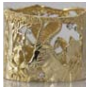
World of Africa Bracelet with 1.60cttw $45000

The World of Africa collection features elephants, giraffes, zebra's and other iconic African animals. Each piece is hand carved by award winning designer Robert Pelliccia. The World of Africa collection is made from 100% recycled 18kt gold and features high quality diamonds that are cut and polished in Namibia.