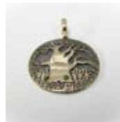
18k Gold Baobab Tree Small Pendant $1600