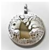
Sterling Silver and 18k Gold Baobab Tree Pendant $800

Made from 100% certifiable recycled sterling silver and 18kt yellow gold, and an imperial chrome diopside gemstone – the Baobab collection symbolizes the importance of living in harmony with nature as well living in peace with one another. In Africa, the Baobab is traditionally known as a food plant that is nutritious and has the potential to boost food security.