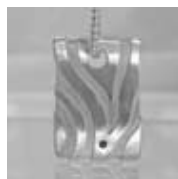
Sterling Silver Zebra Dog Tag $350