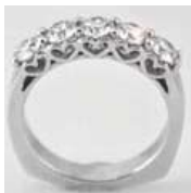
Amore Band 18k White Gold 1.25 cttw