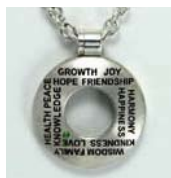
Inspiration Pendant $460 w chain $395 w cord

MEDIA CONTACT : AMY CUNHA : BIG PICTURE PR : 415.362.2085 : WWW.BIGPICPR.COM