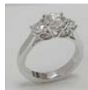
Age of Romance Three Stone Ring Platinum 1.33 cttw